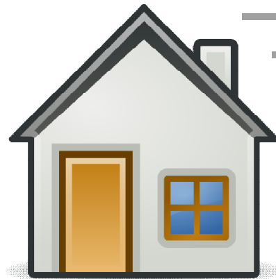
My Safe Place